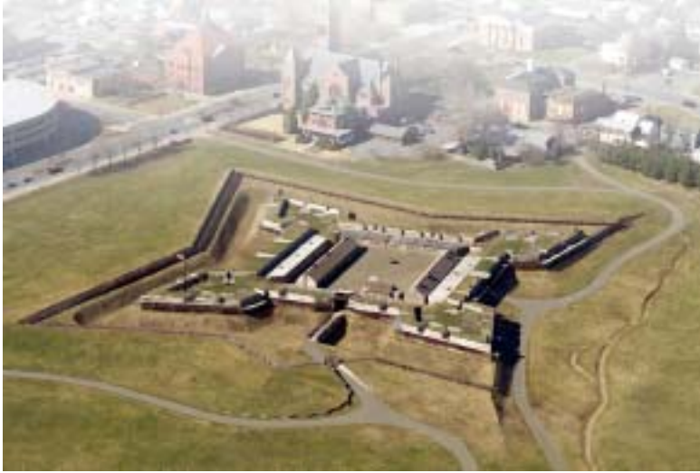
1758: Fort Stanwix, Rome, NY