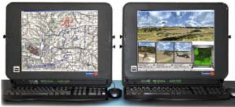
2005: BattleVision Situational Awareness